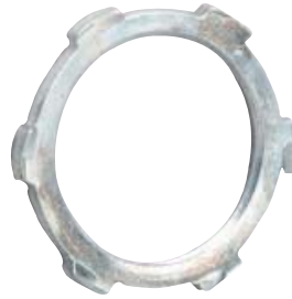
Locknut (See page F92)